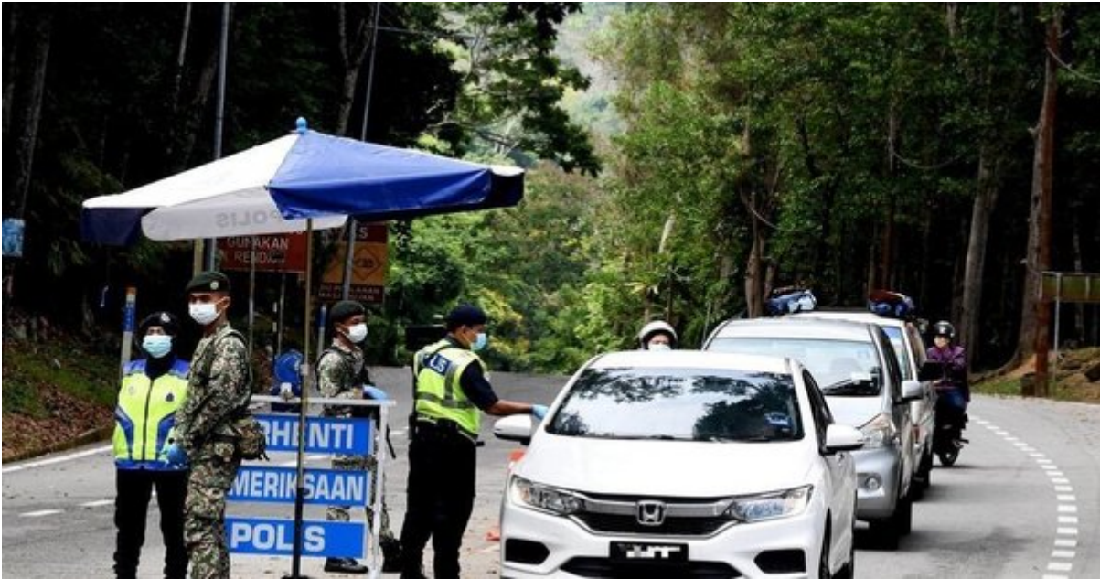
MCO 3.0 Has Been Extended With No Specific Date