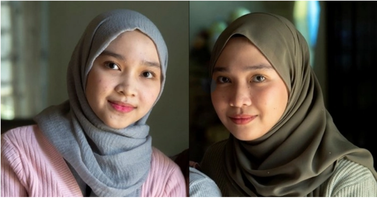
Kota Bharu Twins Lived Apart For 19 Years Without Knowing They Were Swapped At Birth