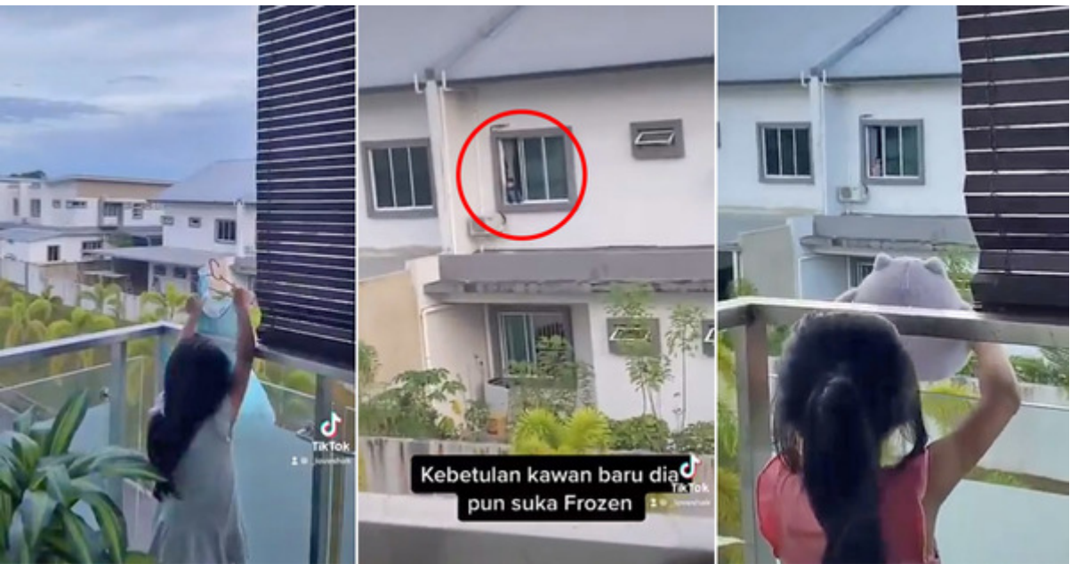
Bintulu Mum Shares How Daughters Made New Friends From Their Balcony During MCO

MyICID concerned about Ivermectin as Covid treatment Sunday, June 27th, 2021